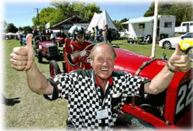
Eulogy (30 th March 2016)