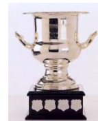
Aussie Car FJ Trophy