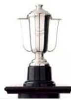
Leo Geoghegan FJ Trophy