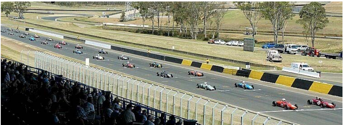
Grid formation of Formula Juniors at the recent Tasman Revival Historic Meeting with almost 40 cars entered.

Not too much wine and Christmas pud now! See you in the New Year