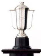
Leo Geoghegan FJ Trophy