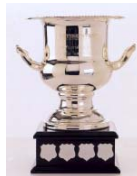
Aon Aussie FJ Trophy