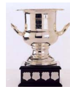
Aon Aussie FJ Trophy