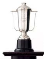
Leo Geoghegan FJ Trophy