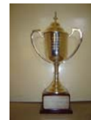
Nereo Dizane F3 Trophy