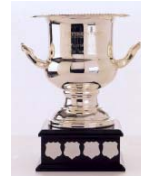
Aon Aussie FJ Trophy