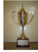
Nereo Dizane F3 Trophy