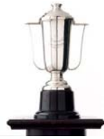
Leo Geoghegan FJ Trophy